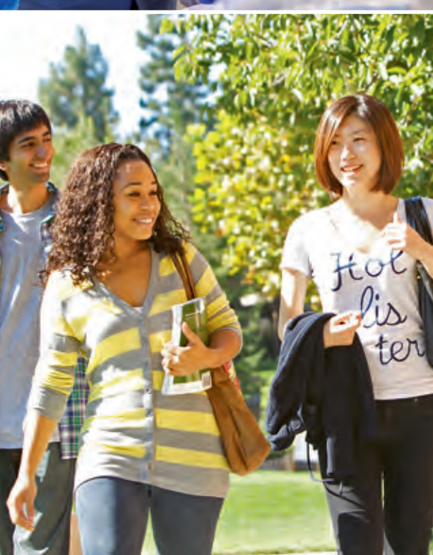
Contra Costa Community College District